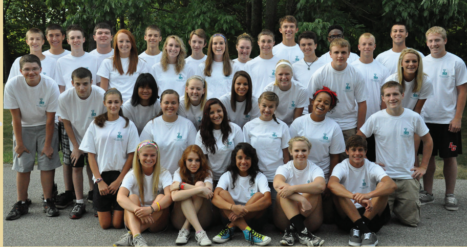
YOUTH LEADERSHIP CLASS OF 2013