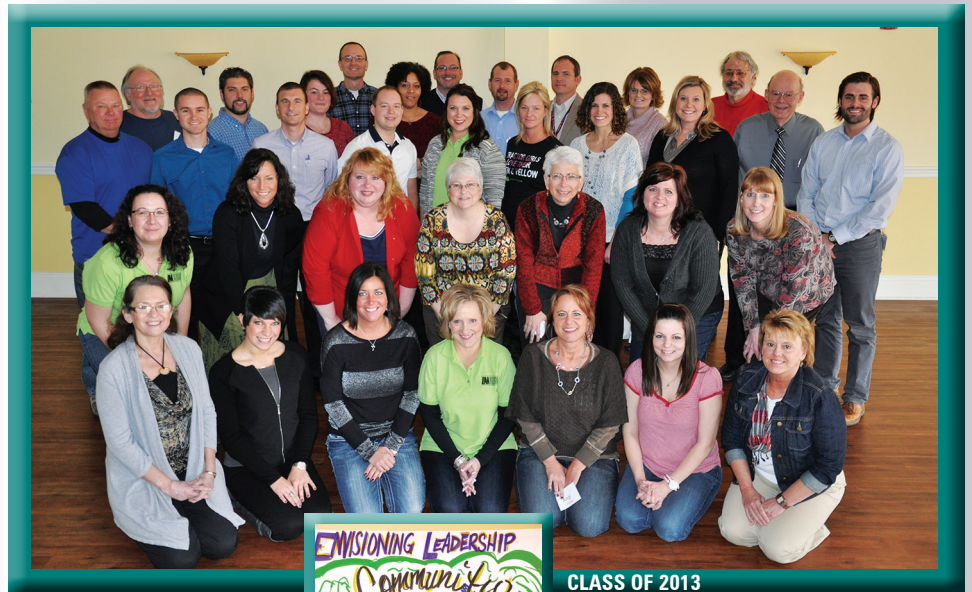
CLASS OF 2013