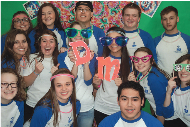
Giving Back! Madison County youth celebrate giving back at Dance Marathon 2015.