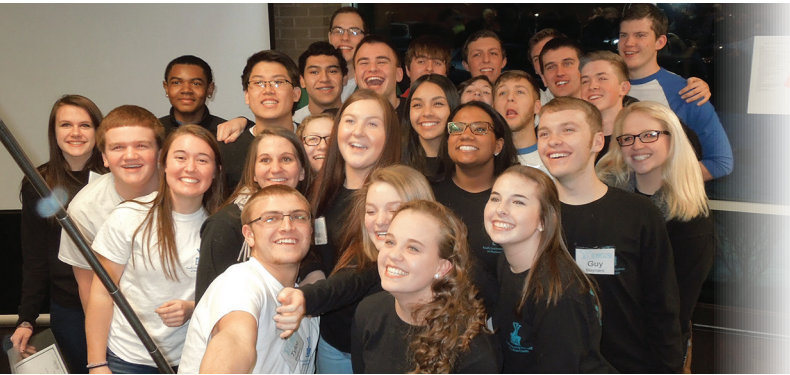
The YLA Class of 2015 poses for one last group photo after celebrating with their friends and family at graduation.