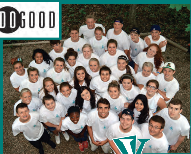
36 Youth Attended This Year's Camp!