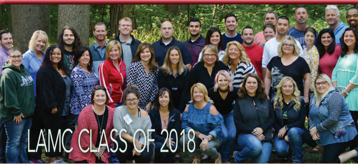
LAMC CLASS OF 2018