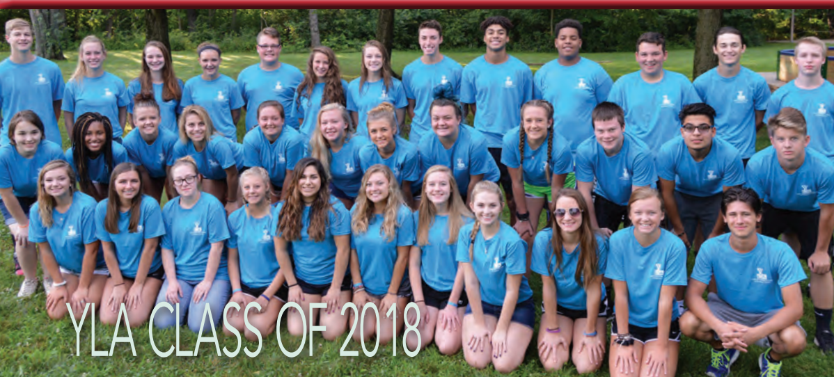
YLA CLASS OF 2018